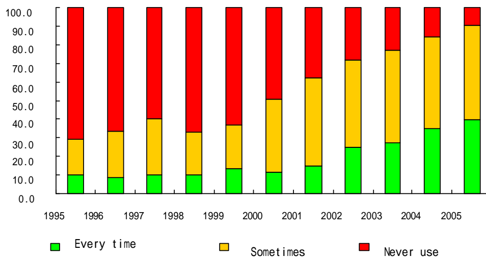
Figure 1 Condom use in commercial sex during last month among FSWs, 1995-2005 (source: National HIV Sentinel Surveillance)

It shows from the results of surveillance over years that the percentage of using condom for every commercial sex among FSWs is slowly increasing, and the year 2004 sees a larger elevation. In the same time, the percentage of those reporting never using condom is decreasing year by year. In 2005, the median of self-reported 'never use condom' and 'use condom for every sex' are 9.8% and 39.9% respectively. (Figure 1)